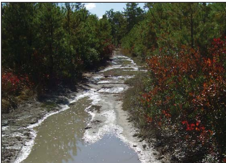
Illegal off-road vehicle use has degraded hiking trail at Crossley Preserve

A second grant for $2,330.00 was awarded to help the Trust acquire a tow behind brush mower. Because it was a relatively small grant amount, unspent funding from 2005 was put towards this project. This mower will maintain field edge trails and other grassy areas. The Trust will put the mower to use along trails at the Thomas F. Breden Preserve at Milford Bluffs. It can be transported easier than a tractor/mower unit, so it will also be put to work at Sweet Hollow Preserve to maintain portions of the Highlands Trail. Volunteer help is needed to develop better trails and rework some old trails at Milford Bluffs. Fallen gates need repair, and many hikers will benefit from better signage and maps. If you have time to offer, please contact the Trust at NatLands@dep.state.nj.us . We invite you to visit these preserves and explore the outdoors on these new trails.