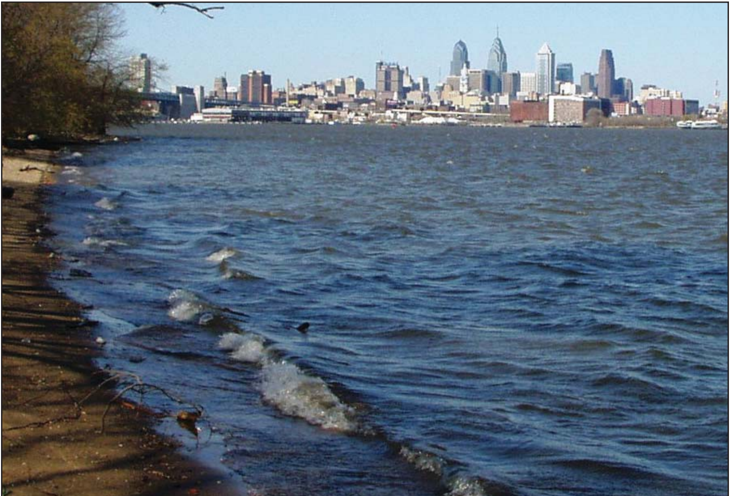
View of Philadelphia skyline from Petty's Island

The charrette participants brainstormed on the multitude of opportunities, as well as challenges, posed by the many endangered and threatened plant and animal species that call Petty’s Island home. The Trust has always intended to facilitate educational and recreational activities associated with natural resources at Petty’s Island, but in a way that is protective of the wetlands and waterfront and provide important habitat to rare species. Thus, the first step was to confirm the actual species located on the island. With a $25,000 grant from the William Penn Foundation, the Conserve Wildlife Foundation of New Jersey retained Herpetological Associates to conduct an intensive plant and wildlife inventory. Specifically, avian, reptile, amphibian, invertebrate and botanical surveys were conducted in early 2010, resulting in at least six rare plant species being documented at Petty’s Island as well as 141 bird, 10 reptile and amphibian, five mammal, 29 butterfly, 10 dragonfly, and four damselfly species. Fifty-four of the observed bird species were confirmed to be breeding on Petty’s Island. Moreover,