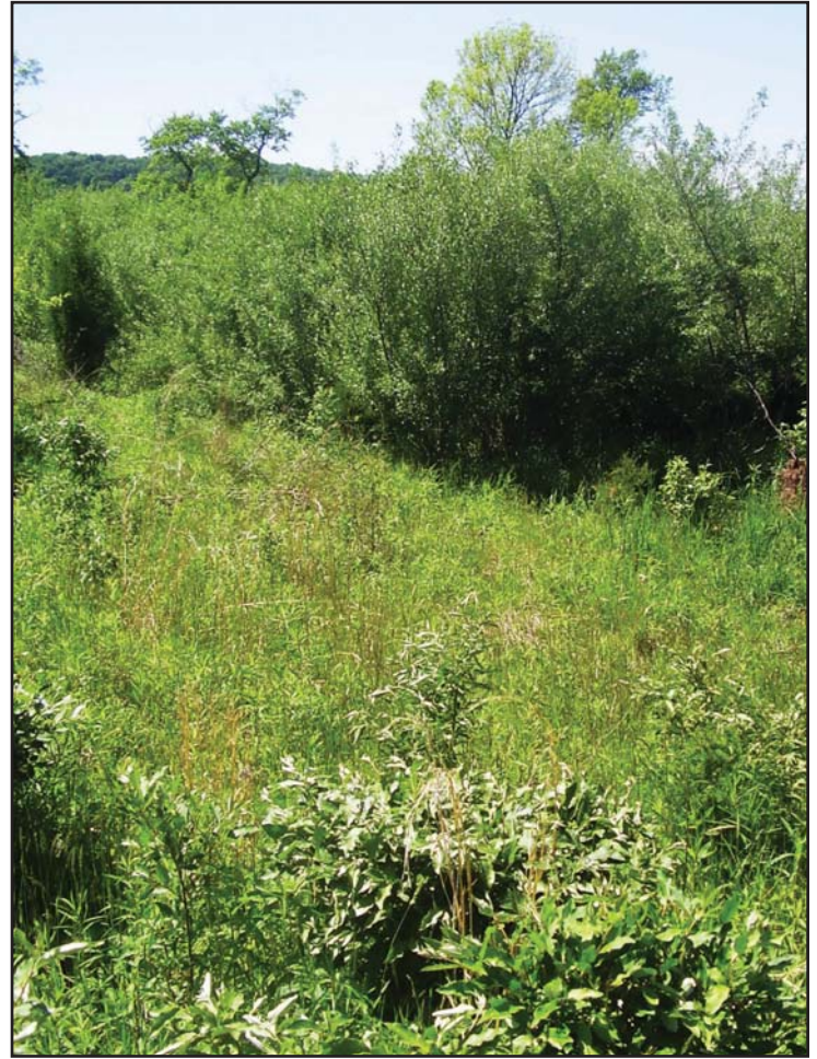
Invasive plants at Thomas F. Breden Preserve at Milford Bluffs

for farming and wildlife. Bring along your binoculars to catch a glimpse of a meadowlark one morning and see what’s on top of Milford Bluffs.