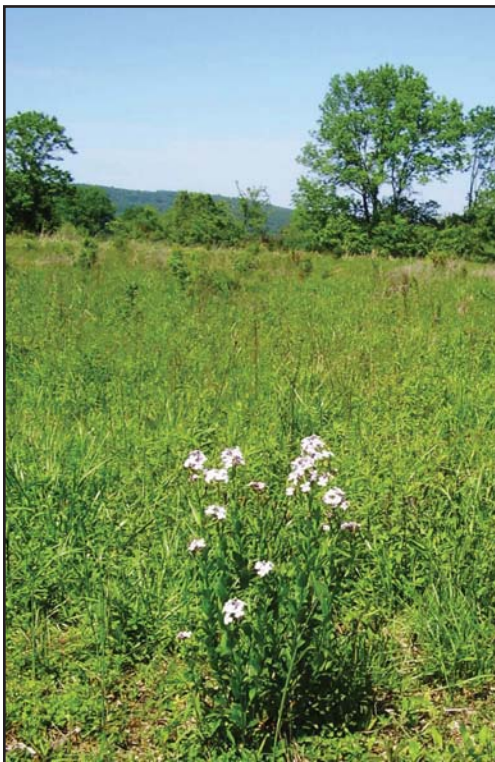
Flowers bloom soon after invasive plant removal