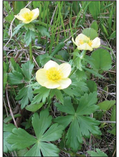
Globally rare, state-endangered spreading globeflower, Photo Credit: Kathleen Walz

Due to concerns about the plant's protection, as well as the likely presence of bog turtle, the Trust is not able to divulge the exact preserve location at this time.