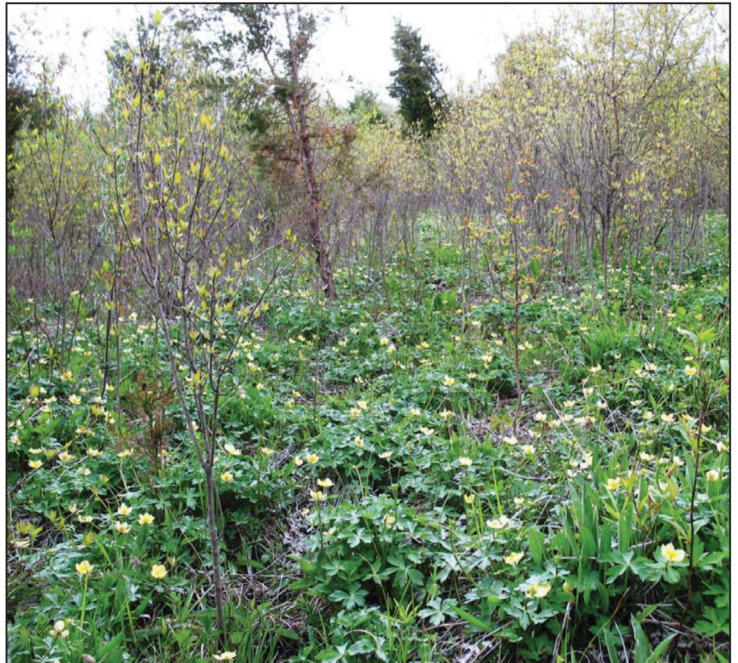
World's largest documented spreading globeflower population on Trust preserve