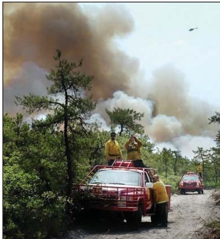
New Jersey Forest Fire Service battling blaze at Warren Grove Bogs Preserve

Although lightning fires are unusual in New Jersey, it's what set the Trust's Warren Grove Bogs Preserve ablaze in June 2010. A combination of hot, dry temperatures and wind created the opportunity; lightning took care of the rest. Bert