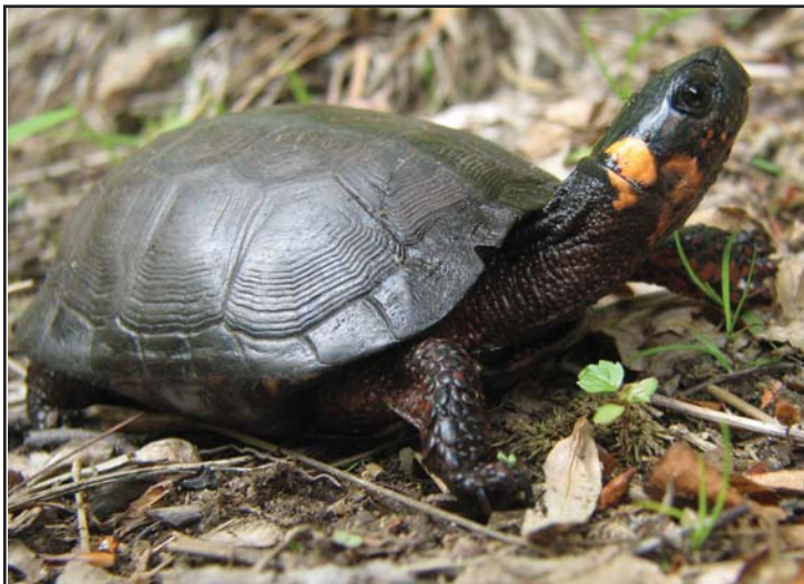
Bog Turtle