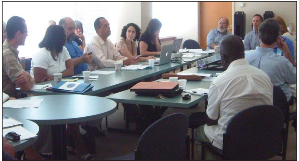
Local stakeholders participating in planning charrette in Camden

a 300-foot forest margin adjacent to water has been identified as key foraging habitat for resident bald eagles in the vicinity of Petty's Island. Interestingly, while eagles are not disturbed by the continuous truck traffic from the existing Crowley operations on Petty's, they are sensitive to human foot traffic, presenting limitations to trail development and boating opportunities at the island.