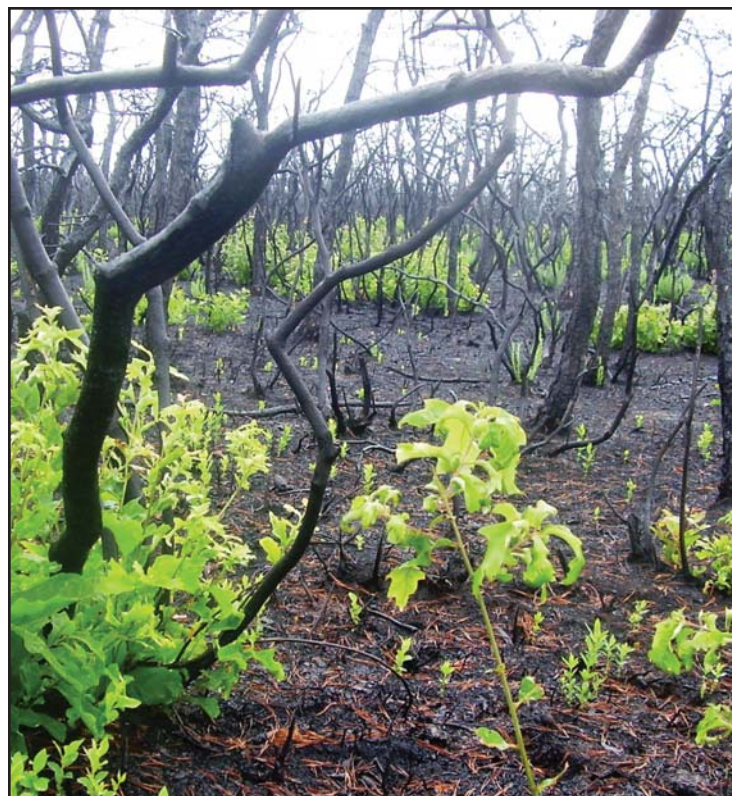
Stunning vegetative regrowth in the aftermath of fire

Plante, division fire warden for the New Jersey Forest Fire Service, noted that they found a tree that was completely split apart at the point of origin of the fire, establishing that it was not caused by any explosives or military firing.