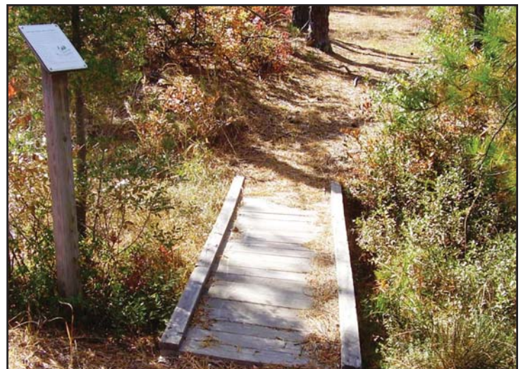
Self-guided hiking trail at Crossley Preserve