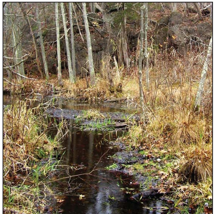
Wetlands provide bog turtle habitat