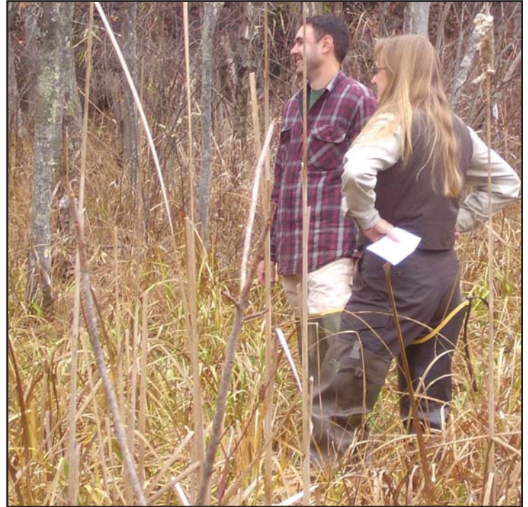
Biologists from US Fish & Wildlife Service and New Jersey Division of Fish & Wildlife evaluating bog turtle habitat

plant species including the state-endangered few-flower spike-rush and large water plantain. Although there are no maintained trails at this time, the Bear Creek Preserve is open to the public and is visually stunning, with Franklinite marble and limestone rock outcrops that border the west side of the valley.