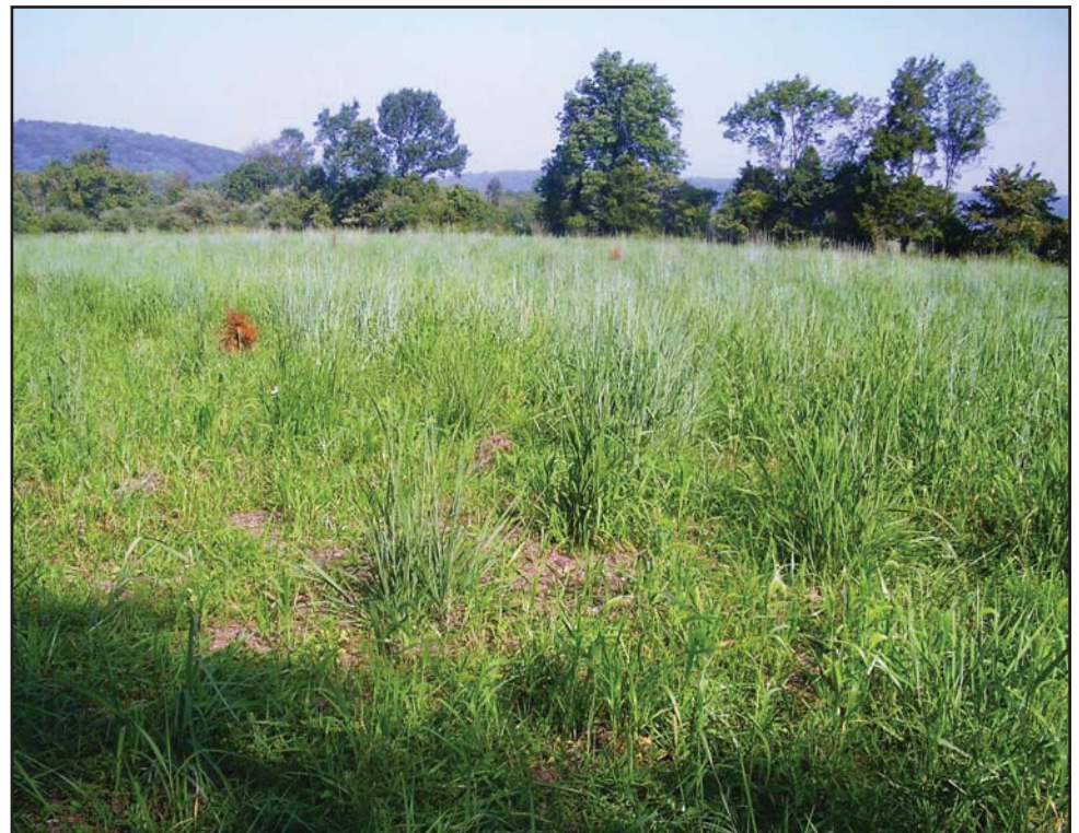
Restoration of native plants at Thomas F. Breden Preserve at Milford Bluffs