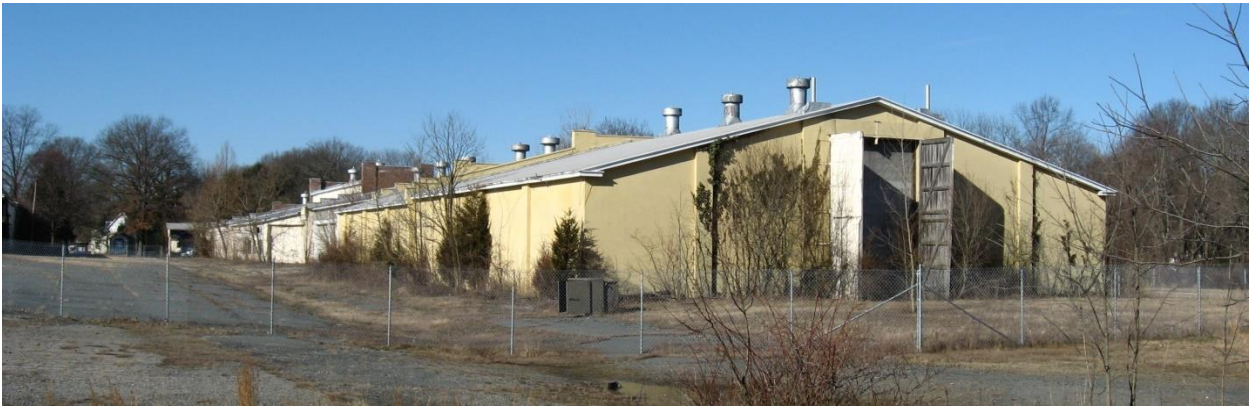
LARGE WAREHOUSE COMPLEX from east