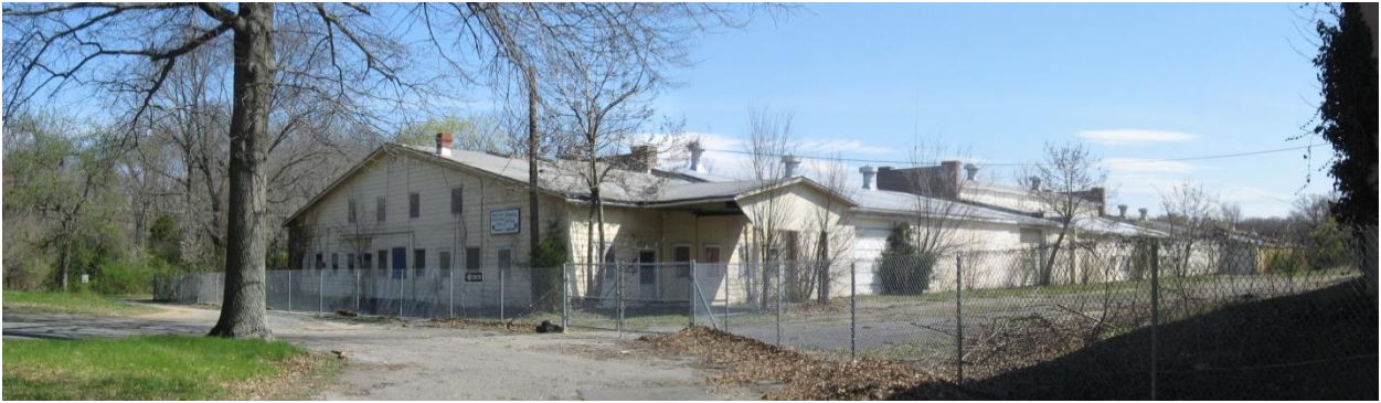
LARGE WAREHOUSE COMPLEX from west