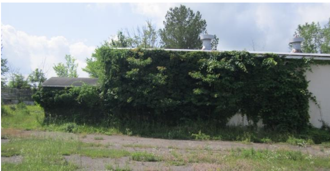
SMALL WAREHOUSE COMPLEX (East end) Bldg 7