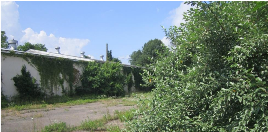
SMALL WAREHOUSE COMPLEX (west end) Bldgs 7 + 8