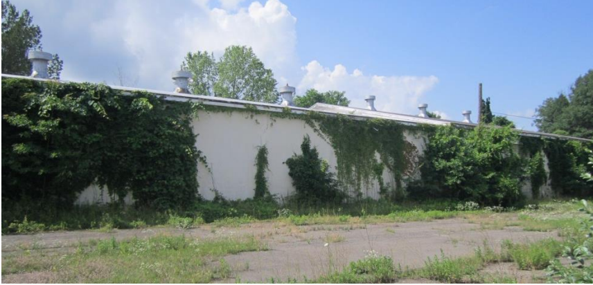
SMALL WAREHOUSE COMPLEX (middle) Bldgs 7 + 8