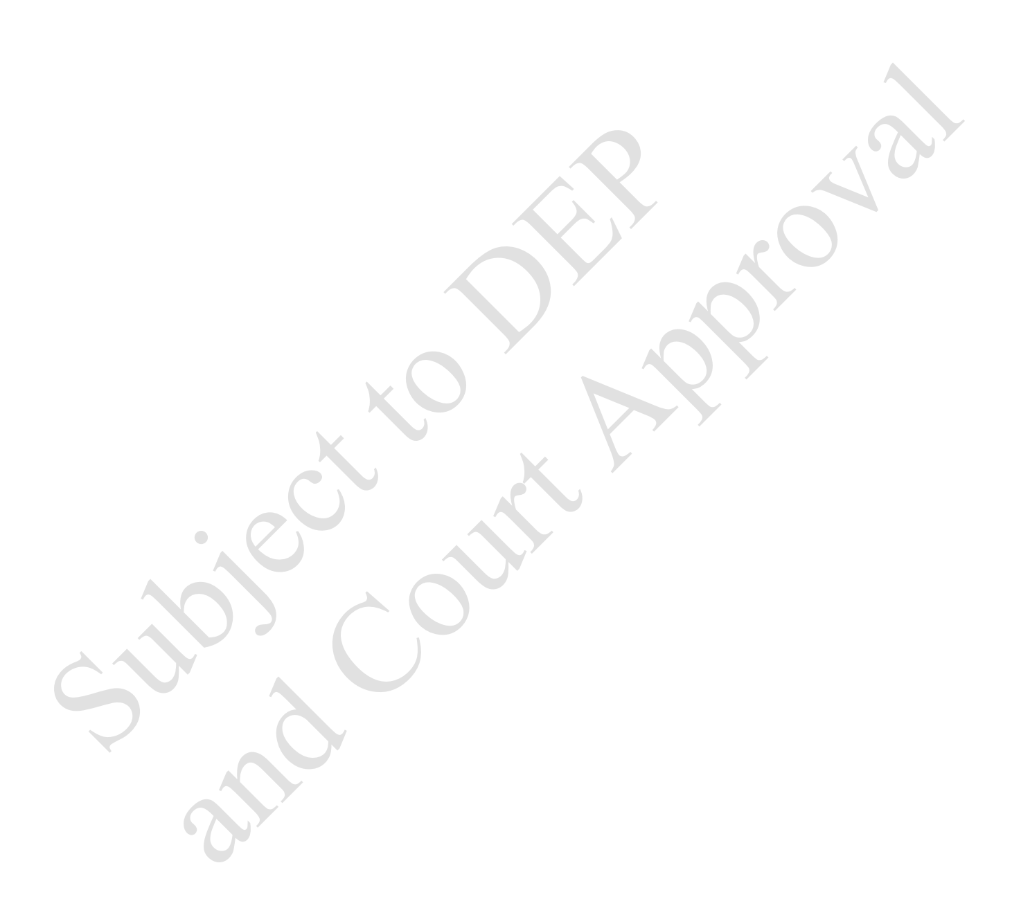
Exhibit B to Settlement Agreement