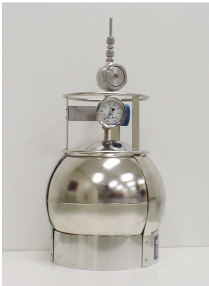
An evacuated air testing canister. The pressure inside the canister is initially set lower than the indoor air, causing air to flow into the canister when the valve is opened.

During indoor air testing, a canister is placed in the basement, crawl space or other part of the building for a period of time (normally 24 hours). If the analysis of the indoor air sample shows VOCs related to the subsurface contamination are present above NJDEP's Indoor Air Screening Levels (IASL), vapor intrusion is likely occurring. Additional evaluation of the property may be needed to confirm this finding.