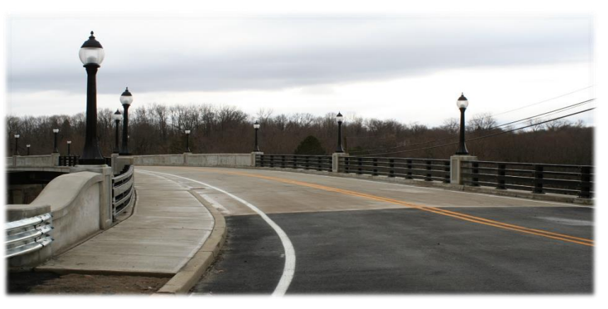
20131230 PIC E07 Site viewed from Fowler St Intersection looking NV/ 804