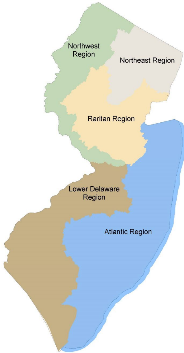
Figure 1. NJDEP- BFBM/DSR targeted monitoring by rotating basin and schedule year for sampling. New Jersey has five major water regions and are rotated in the following order (Northwest, Northeast, Raritan, Atlantic, and Lower Delaware).