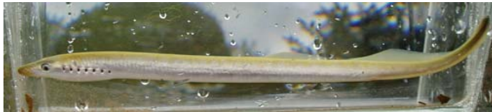
American Brook Lamprey