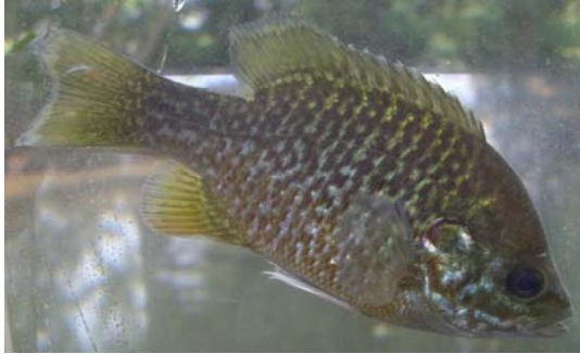
Pumpkinseed x Redbreast Sunfish Hybrid