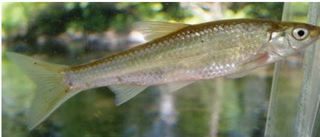
Eastern Silvery Minnow