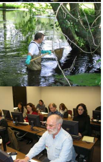
I am already using the Volunteer Monitoring (VM) data management system. Do I need to switch over to the WQDE system?

WQDE will be used primarily for the development of NJ's Integrated Water Quality Monitoring and Assessment Report and the List of Water Quality Limited Waters - the federally mandated, biennial assessment of statewide water quality ("305(b) Report" and "303(d) List"). This assessment evaluates and establishes the quality of the State's waters and provides information on the effectiveness of activities to manage and restore our waters. WQDE complements the Volunteer Monitoring (VM) Data System, which is NJDEP's data management system for volunteer-collected water quality data.