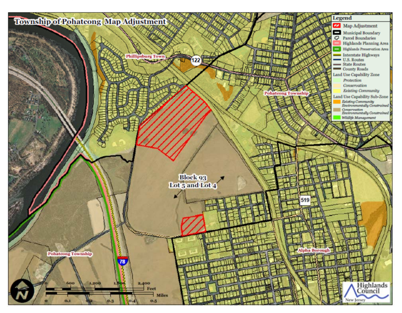
Figure Pohatcong MA-1. Map Adjustment for Hamptons at Pohatcong