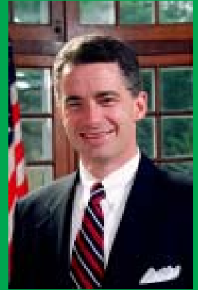
James E. McGreevey Governor