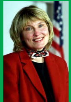
Holly C. Bakke Commissioner