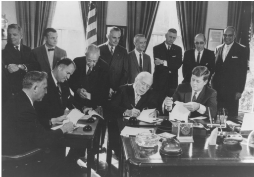
White House ceremonial signing of the Delaware River Basin Compact, Nov. 2, 1961.

A breakthrough in water resources management occurred in 1961 when President Kennedy and the governors of Pennsylvania, New Jersey, New York and Delaware for the first time signed concurrent compact legislation into law creating a regional body with the force of law to oversee a unified approach to managing a river system without regard to political boundaries.