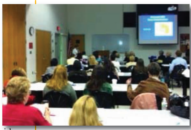
Middlesex County Fire Academy, May 16, 2011

Evaluations from the May 16, 2011 training at Middlesex County were positive. There are two additional trainings planned for June in Paramus and Sewell. It is expected that the training will be offered again in the fall. Check the New Jersey Learning Management Network (NJLMN) for date/location. This program will also be converted to an on-line training once the in-person trainings are completed. Look for the on-line module in late fall/early winter on NJLMN.