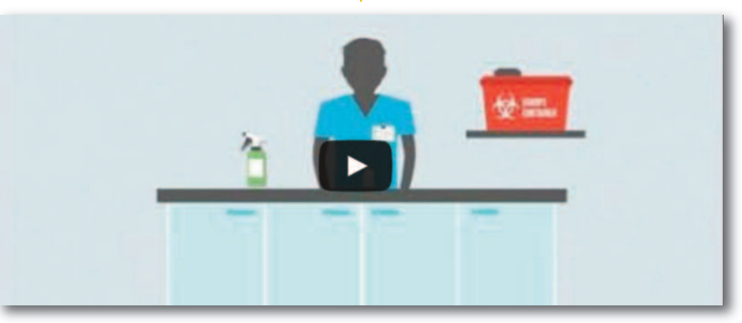
Click on image to view videos

NEW Videos! Two new videos for healthcare providers and office managers are now available on the One & Only Campaign website. These videos detail critical information to help all providers and facility managers keep patients safe from unnecessary harm. http://oneandonlycampaign.org/