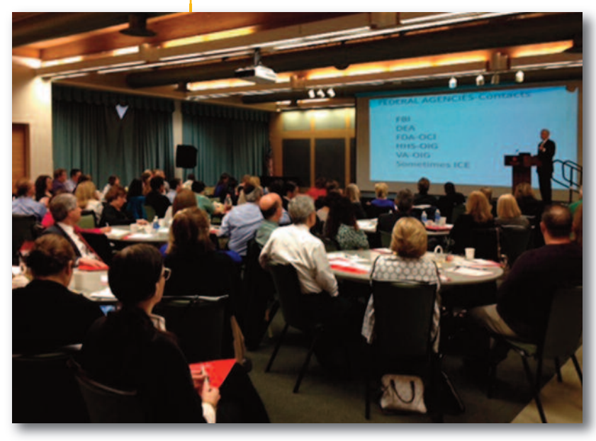
New Jersey Drug Diversion Conference at Rutgers University.

To see NJ's safe injection practice initiatives, visit: www.oneandonlycampaign.org/partner/new-jersey 🔝