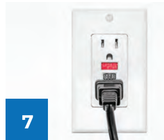
7 Plug in Unit