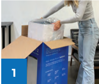
1 Unbox unit (DO NOT plug in unit yet)