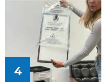
4 Remove plastic protectant covering from filters