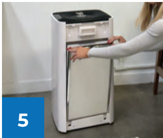
5 Replace filters