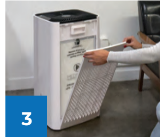
3 Easily remove side panels from side of unit