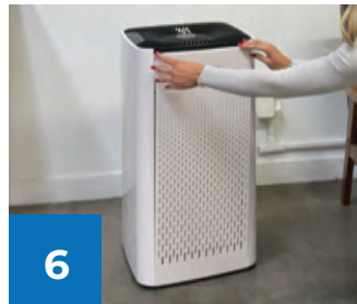
6 Replace side panel