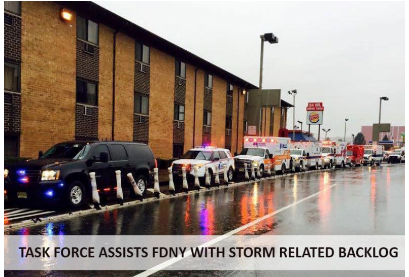
TASK FORCE ASSISTS FDNY WITH STORM RELATED BACKLOG

The NJ EMS Task Force was created in the aftermath of the Sept. 11, 2001 terrorist attacks. The organization responds to large-scale man-made events and natural disasters.