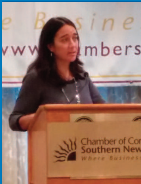
Commissioner addressed the Chamber of Commerce of Southern New Jersey.