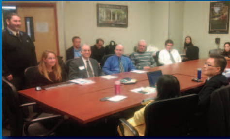
On Dec. 18, the Department's Food and Drug Safety Program staff met with a delegation from Guangzhou, China.