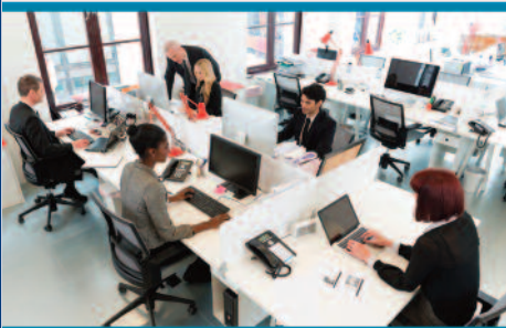
New Jersey's Worksite Wellness Toolkit