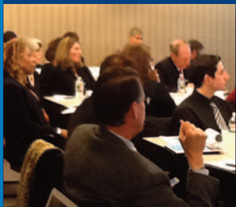
Stakeholders from corporate, foundation, academic and nonprofit organizations gather for the roll-out of the Working Well in NJ Toolkit .