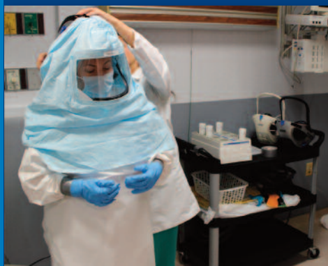
Robert Wood Johnson University Hospital staff practices using Personal Protective Equipment (PPE).

run by NJ Poison Information and Education System (NJPIES)