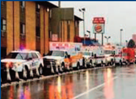
New Jersey EMS Task Force assists FDNY with storm related backlog.

New Jersey’s EMS units responded to about 30 calls before returning to New Jersey at 10:30 p.m. Sunday evening.