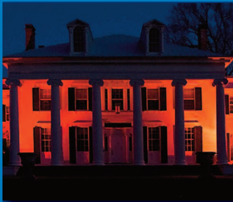
Drumthwacket, the Governor's official residence, "glows red" on February 6, National Wear Red Day to shine a light on the impact of cardiovascular disease in women.

New Jersey is recognizing February as American Heart Month with events across the state to raise awareness of heart disease. Heart disease is the number one cause of death in New Jersey with more than 18,000 deaths annually in the state. During American Heart Month, Wear Red Day was celebrated on February 6 to focus attention on the impact that heart disease has on women.