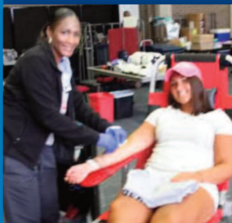
More than 100 donors gave blood. Some gave double red cell donations through a special process that allows donors to give two units of red blood cells.