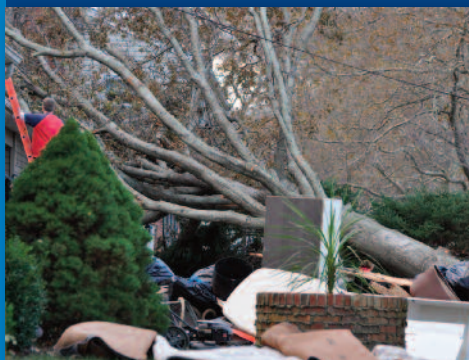
Manasquan, N.J., Nov. 3, 2012 -- Survivors work to remove a large tree from the roof of a home in Manasquan. The area was pounded by Sandy. FEMA is working with many partners and organization to assist residents affected by Hurricane Sandy.