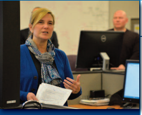
Acting Health Commissioner Cathleen Bennett emphasizes the importance of keeping healthcare data secure.