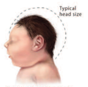
Baby with Microcephaly