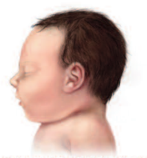
Baby with Typical Head Size

Let's Zap Zika together as we increase our preparedness and protect New Jersey residents from this virus and its associated health consequences for pregnant women and their children.