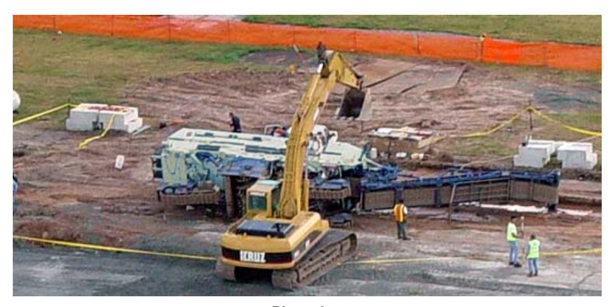
Photo 2 Photo of incident site showing excavator lifting machine

were small mounds of concrete debris in the area. As the machine backed over one of these mounds, the difference between the lower and higher tracks exceeded the machine's slope design limitations. The operator said that he felt the machine "kick" and start to tip, and tried to level out the machine by adjusting the track height. The foreman/groundsman yelled for him to