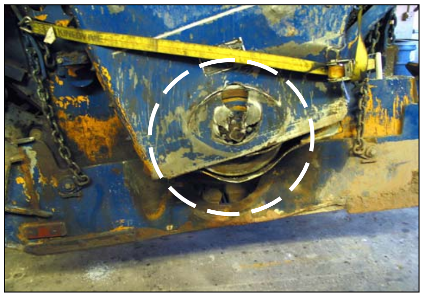
Photo 3 Damage caused by rotating drum bearing cutting through machine's sheet metal during tip-over