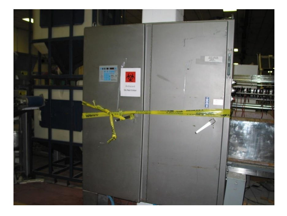
FIGURE 1: Front view of electrical cabinet upright.

worker pulled the victim free. Two of the workers immediately began to administer CPR. Police and EMS arrived and the victim was transported to the hospital, where he was pronounced dead on arrival due to compressional asphyxia along with severe chest and spine injuries