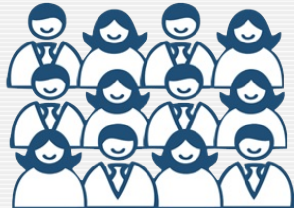
At risk and binge drinkers