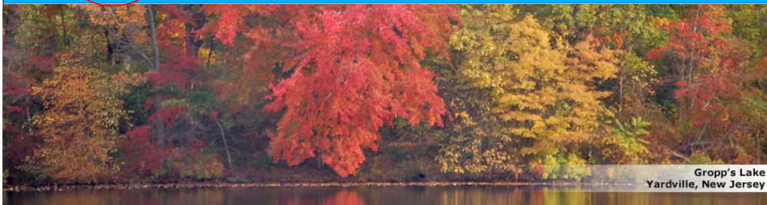
Gropp's Lake Yardville, New Jersey