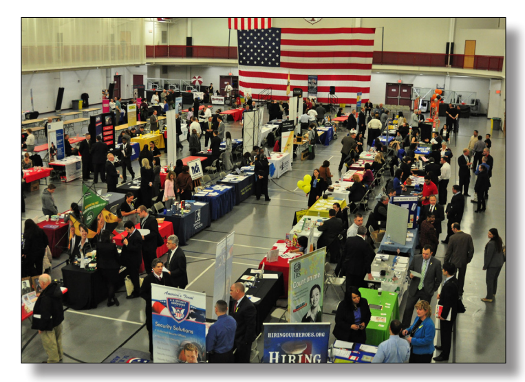
More than 110 veterans looking for jobs got the opportunity to meet with employers at the Hiring Our Heroes job fair held at Rider University March 21, 2013. The Rider student recreation center floor in Lawrenceville was filled with more than 70 employers and 19 veteran service organizations. Veterans can use the Hero To Hired website <a href="https://h2h.jobs/">https://h2h.jobs/</a> to start a job search.

With an annual allocation from DM-HAS of $850,000, CCGNJ works with 35 agencies statewide to provide education and treatment to problem gamblers and maintains a 24-hour confidential hotline, 1-800-GAMBLER and the website <a href="http://www.800gambler.org">http://www.800gambler.org</a> that lists additional resources.