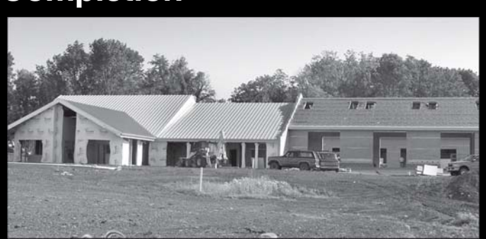
band George for the purchase and installation of a a flag pole at the new Administration/Maintenance building. The building is tentatively scheduled to be completed Oct. 17, with a dedication ceremony to be held in the Spring of 2007.