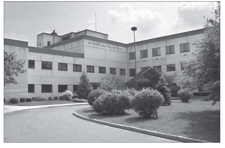
Patterson Army Health Clinic as it appears today.