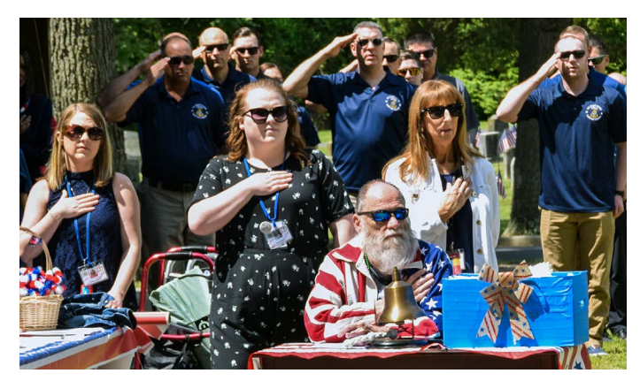
Above: Residents, staff, and members of the Coast Guard Petty Officers Association render honors during the Memorial Day observance at the New Jersey Veterans Memorial Home at Vineland May 22, 2019. Below: Residents enjoy a barbeque hosted by the Home's staff after the ceremony. Bottom: Remembrance wreaths float in the memorial pond.