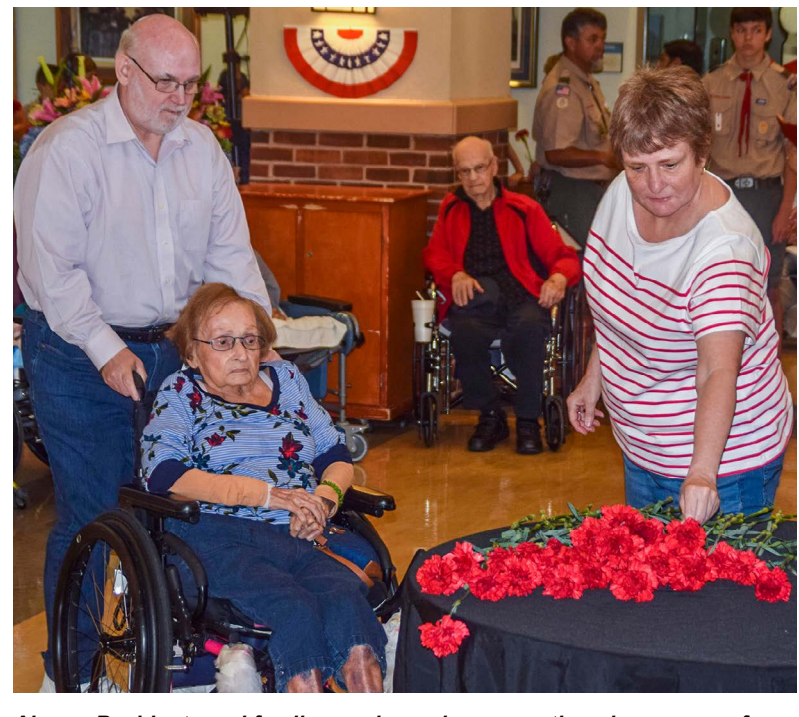
Above: Residents and family members place carnations in memory of loved ones during the Memorial Day ceremony at the New Jersey Veterans Memorial Home at Menlo Park May 27, 2019.