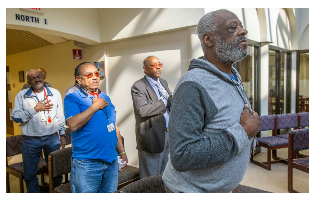
Vietnam veterans at Veterans Haven North in Glen Gardner, N.J., render honors during the 50th anniversary commemoration of the Vietnam War March 28, 2019. The ceremony honored 13 Vietnam veterans.

"All citizens of New Jersey must recognize the honorable service of the 119,910 men and women from New Jersey who served in the Southeast Asiatic Theater of Operation, and memorialize the 1,556 New Jerseyans who made the ultimate sacrifice during the Vietnam Conflict." Vietnam War Veterans' Day Proclamation