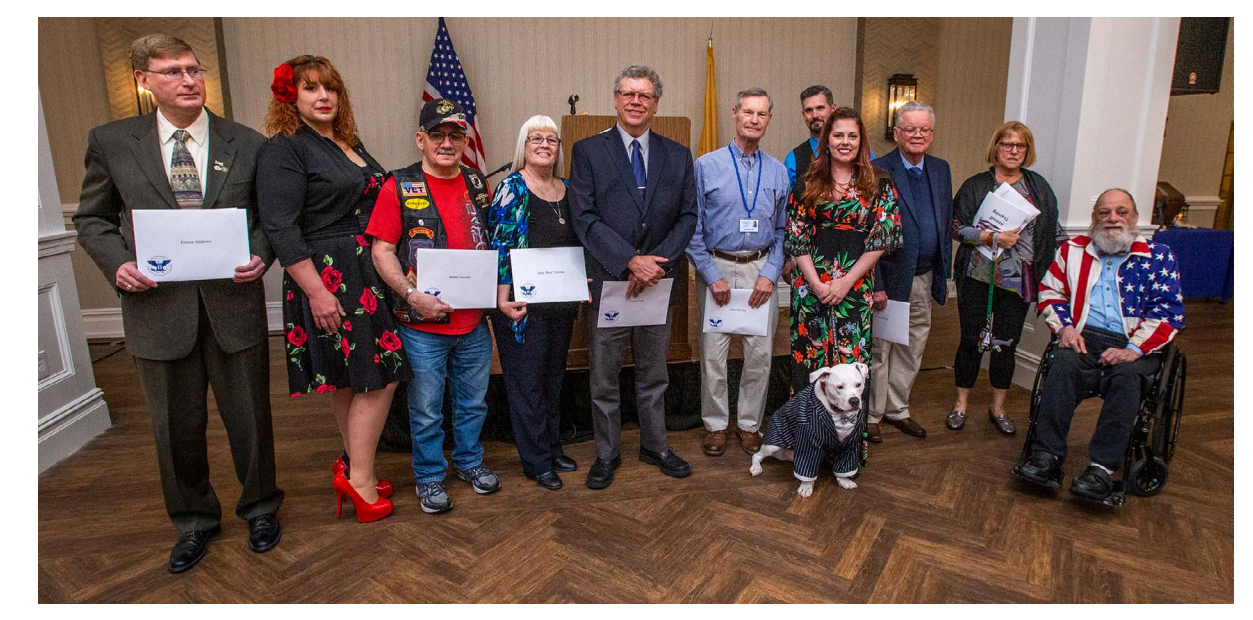
Presidential Service Award recipients pose for a photo after the Home's annual volunteer luncheon. At the luncheon, volunteers and organizations were honored