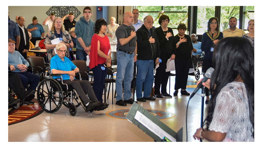
Above: Residents, staff, and family members sing the national anthem during the Memorial Day observance at the New Jersey Veterans Memorial Home at Paramus May 23, 2019. Left: A resident places carnations in memory of friends who had passed since last Memorial Day.