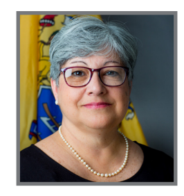
Diane Gutierrez-Scaccetti Commissioner of Transportation