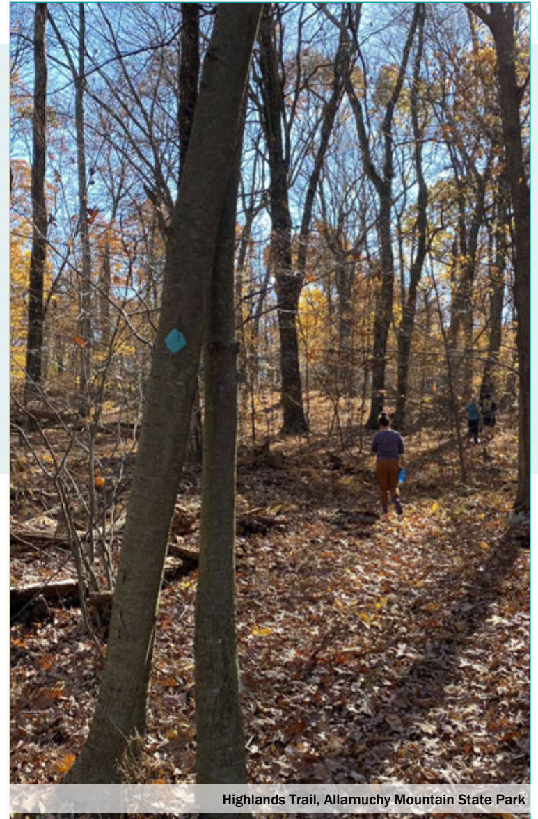
Highlands Trail, Allamuchy Mountain State Park