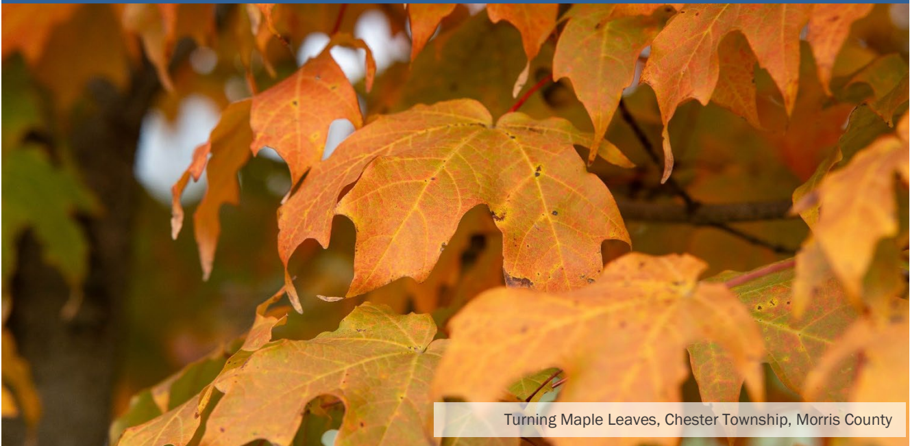
Turning Maple Leaves, Chester Township, Morris County