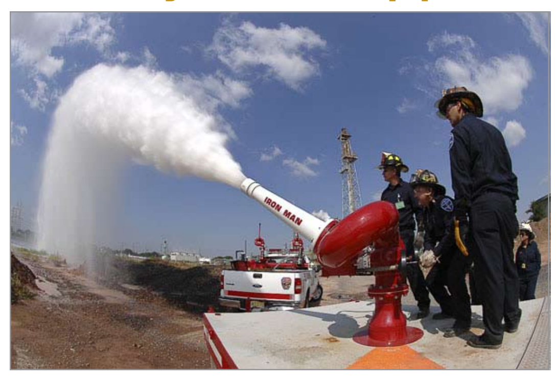
EMS personnel test the Neptune System.

WOODBRIDGE, NJ,- Recently, county and local public safety officials conducted a full-scale emergency response exercise, the Garden State's first exercise of this kind in a petrochemical facility. The New Jersey Office of Emergency Management in coordination with the New Jersey Division of Fire Safety, the New Jersey Office of Homeland Security and Preparedness and Northeast New Jersey Northeastern New Jersey Urban Area Security Initiative (UASI) held the multi-agency exercise at Hess Corporation's Port Reading refinery and terminal