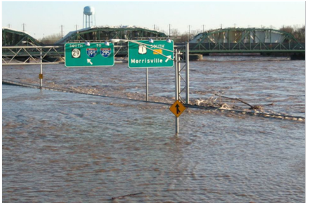
The Delaware River at Flood Stage