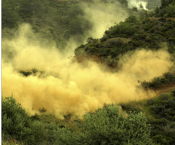
IST will be able to assist in those efforts, saving time, property & possibly lives.

Burlington County, through its Office of Emergency Management, will be the first county in New Jersey to establish an Incident Support Team (IST) that will be available to any Incident Commander during a large scale, complex or long-term disaster.