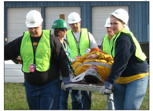
Neighborhood Watch (NW)

We live in a different world than we did before September 11, 2001. We are more aware of our vulnerabilities, more appreciative of our freedoms, and more understanding that we have a personal responsibility for the safety of our families, our neighbors and our nation. But we also know that we can take action now to help protect our families, help reduce the impact an emergency has on our lives, and help deal with the chaos if an incident does occur. The Neighborhood Watch Program is a highly successful effort that has been in existence for more than thirty years in cities and counties across America. It provides a unique infrastructure that brings together local officials, law enforcement and citizens to protect our communities.