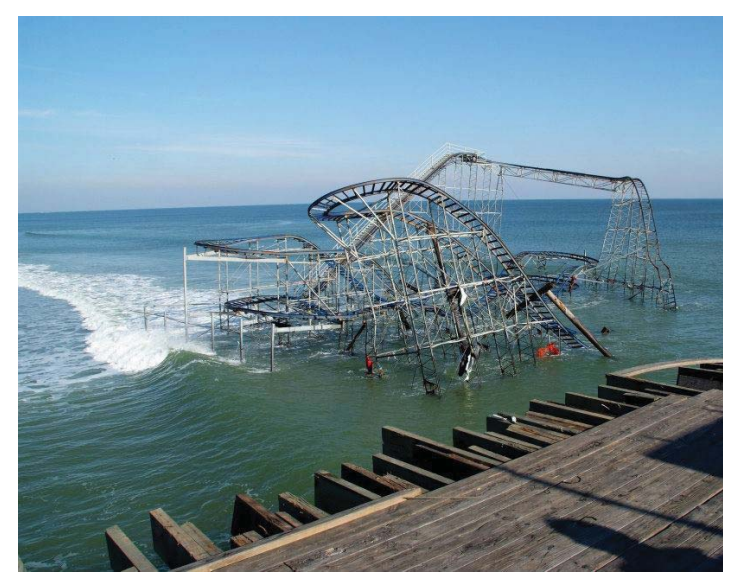
NJ Hurricane Survival Guide