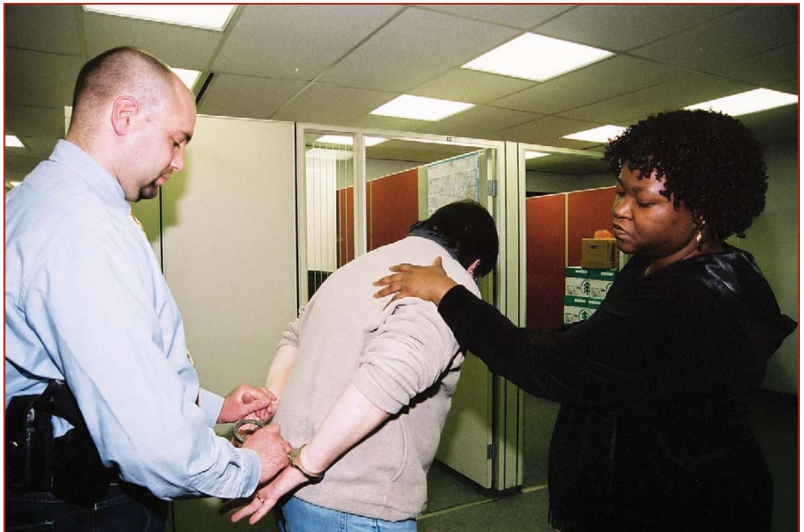
A parole violator is placed into custody at one of the Board's District Parole Offices.

The law provides that the term to be served in confinement for violation of a condition of parole supervision for life cannot be reduced by credits for good behavior, the performance of a work assignment or assignment to minimum custody status. Additionally, the term to be served for violation of a condition of parole supervision for life may not be aggregated with any other sentence that may be imposed for the commission of