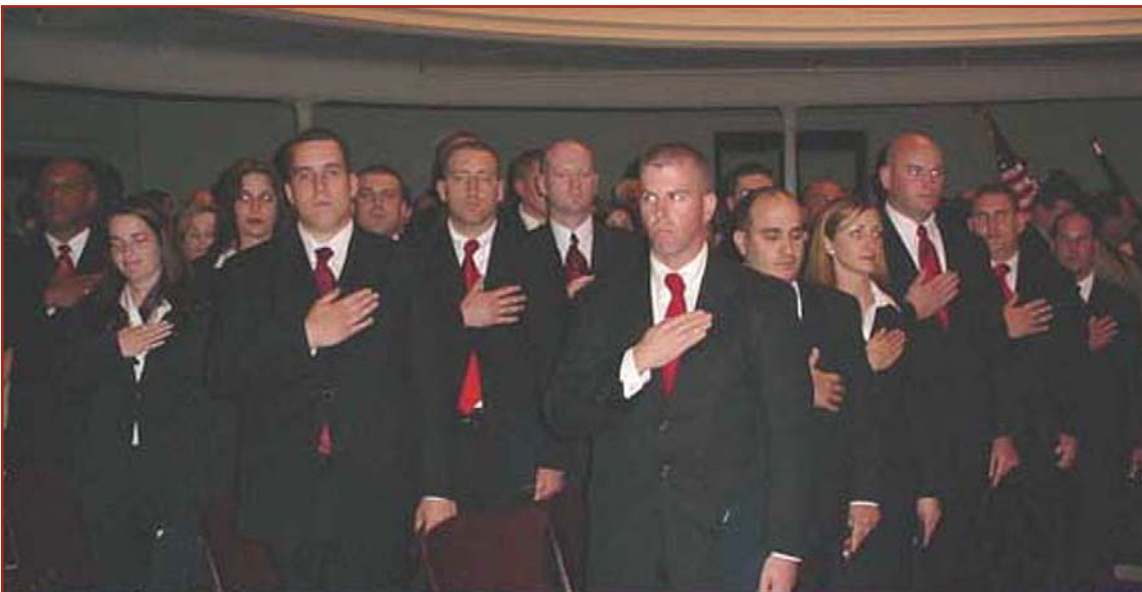
Parole Officer Recruit Class # 20 recites the Pledge of Allegiance at their graduation ceremony in May 2004.

The Division of Parole has consolidated the task of locating parole absconders missing 90 days or more into a single Fugitive Unit. This unit is responsible for locating and arresting missing parolees as well as case management. The unit has