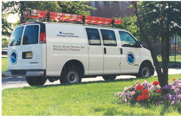
PVSC's Cleanup Van