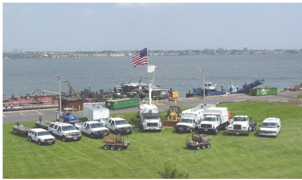
PVSC's Equipment (2009)