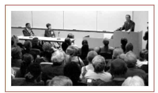
Acting Governor Donald T. DiFrancesco addresses N.J. History Issues Convention, March 16, 2001

Like Goal 4, this goal addresses the archival community's longterm need to increase its financial and institutional resources. But here, the plan takes a longer view, recognizing that underfunding of archival programs arises from public misunderstanding about the full range of the uses and values of historical records. The activities outlined in Goal 5 aim to improve public and governmental support of records programs, by educating and involving citizens and leaders in the business of records administration.