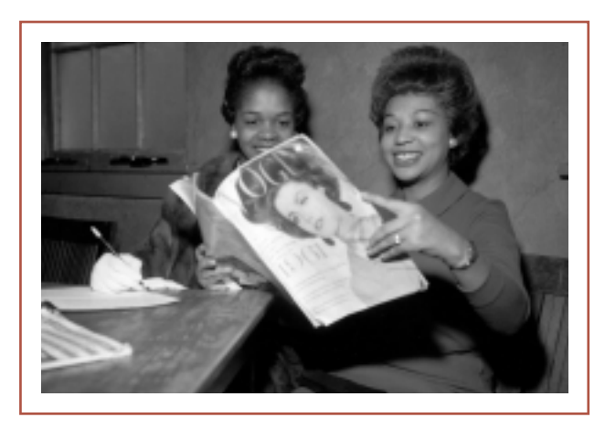
Modeling for Colored Elks Club show, New Brunswick, N.J., 1961, courtesy of Rutgers University Libraries, Special Collections and Archives

This goal seeks to increase the collecting of records from individuals and groups who heretofore have gone relatively underdocumented in the state's repositories: these include new immigrant populations, workers, African Americans, and women. The last three groups have historically been excluded from the mainsprings of power in American society and, until relatively recently, from the interest of historians and archivists. Recent immigrants simply have not been in the U.S. long enough to develop the kind of self-consciousness of past necessary for generation of archival collections suitable for donation to repositories. Archivists therefore need to be more proactive in seeking out the literature of recent immigrants.