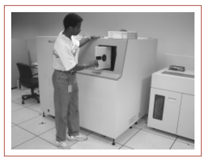
FileNet<sup>™</sup> optical disk system, courtesy of New Jersey Division of Revenue

For our purposes, it may be said that there are two different kinds of electronic records: databases and imaging systems. The former store abstracted data in structured formats on magnetic disks and tapes; the latter record images of entire documents onto optical disks and CD-ROMs. The greatest threat to the continued accessibility of both kinds of electronic records arises from the rapidity of technological change. A oncethriving, widely used automation system can become useless if the technology on which it is based becomes so obsolete that it cannot be transferred or migrated to the