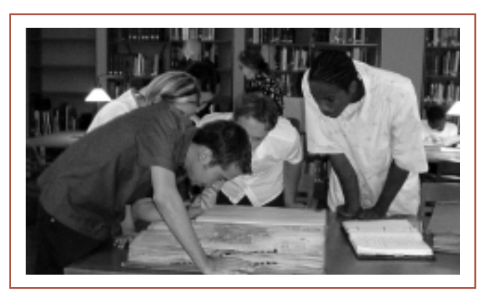
Students study historical documents

For too long within the state's history community, educators and archivists have worked in separate worlds, when they could have profited from a fruitful interaction. The activities in this goal should result in increased use of historical records in the classroom, where they will enrich learning and excite student participation in ways that textbooks and other secondary sources cannot. In turn, repositories will benefit from having a new generation educated with an understanding of the unique value of original archival records.