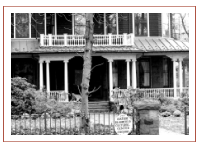
Oakeside Bloomfield Cultural Center

This goal addresses the heart of archival work: cataloging, conserving, and storing records. Archivists catalog manuscripts by describing them in a common format, using standard terminology so that the resulting records convey universally understood meaning and can be transported electronically throughout hyperspace. Archivists conserve historical records by handling, packaging, and sometimes reformatting to maximize their longevity, drawing on scientific knowledge informed by continual experimentation. Finally, they store archival materials in secure, climatically stable facilities. A survey of the state's 1,300+ historical records repositories revealed wide gaps in their ability to exercise these basic professional functions. Through these goals and their related activities, the plan seeks to narrow those disparities.