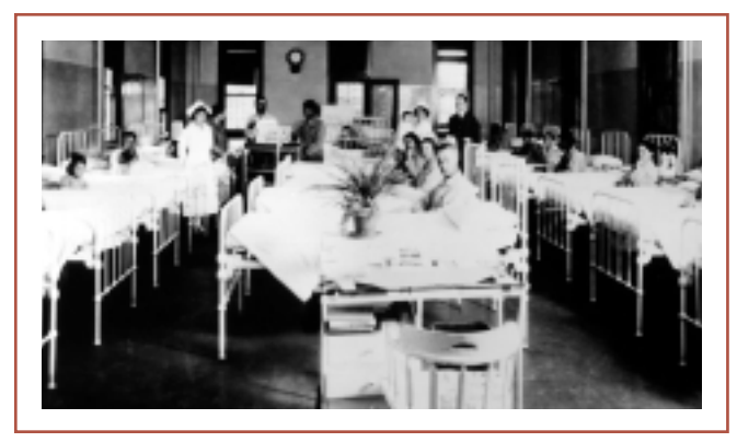
Women's ward in the contagious disease hospital at Ellis Island, N.J., ca.1922, courtesy of National Park Service, Statue of Liberty National Monument and Ellis Island Immigration Museum.

The preceding tables make it possible to classify the state's nongovernmental repositories in terms of overall quality. The presence of paid professional staff and adequate climate controls are arguably the most basic elements in operating a sound archival program. Moreover, improving them may lie beyond the fiscal resources that will be available to the New Jersey SHRAB. With funding from the legislature and NHPRC, the board and other granting agencies can provide enough archival supplies and training to turn a poor repository into an excellent one—provided that the organization has sufficient dedicated and skilled personnel to organize and make available its collections, and the proper security and environmental controls to prevent their eventual loss or disintegration.