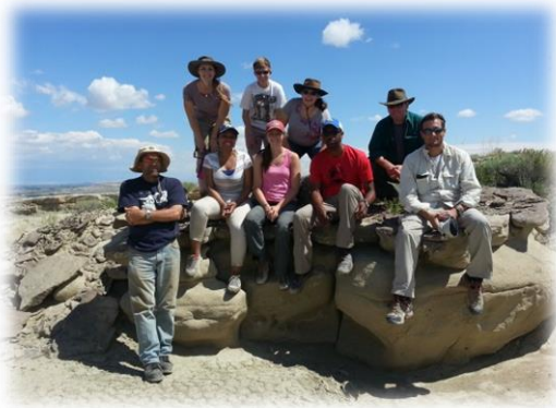
Members of the 2014 Paleontology Field Camp team in northern Wyoming.