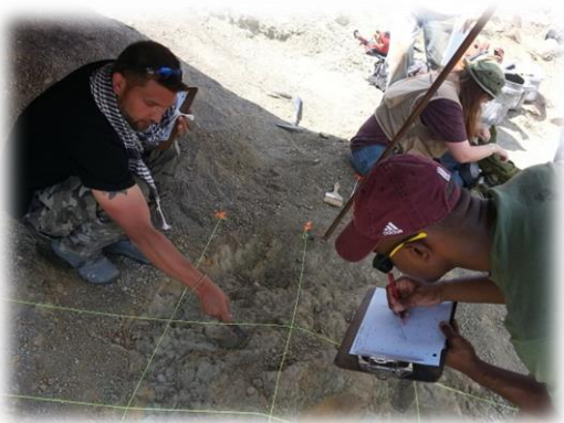
Students mapping a Pachycephalosaurus quarry in 2014 in northern Wyoming.