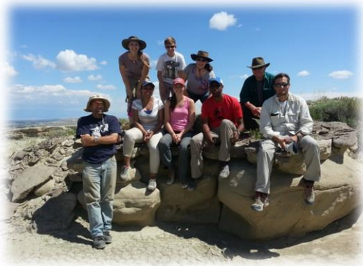
Members of the 2014 Paleontology Field Camp team in northern Wyoming.