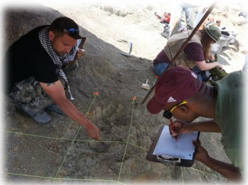
Students mapping a Pachycephalosaurus quarry in 2014 in northern Wyoming.