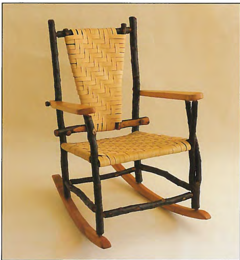
Mark Sharrock Plum Rocker with Reed Seating, 2007 Plum wood 37 x 24 x 36 in. Collection of the artist