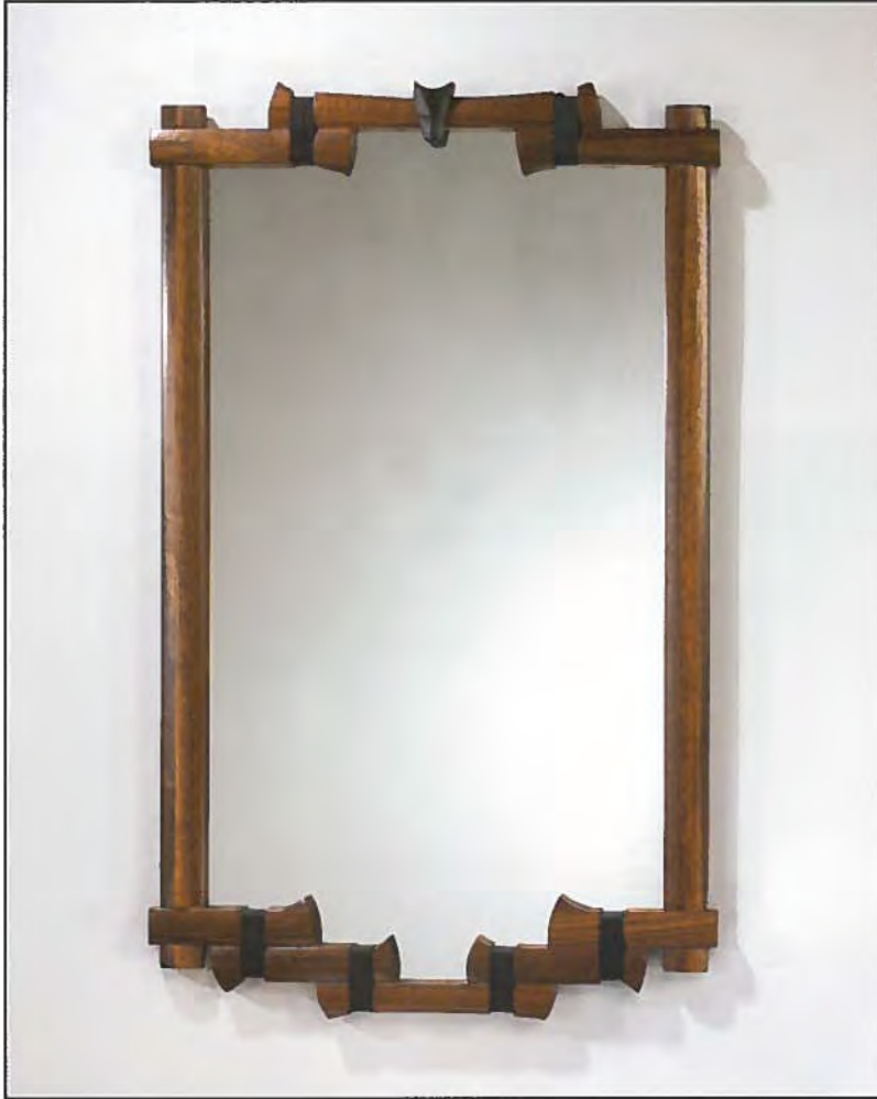
Glen C. Guarino Shedua Mirror, 2007 Shedua and Ebony 30 x 19 x \frac{3}{4} in.