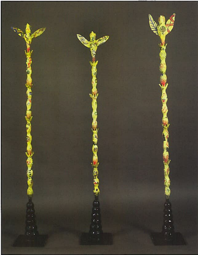
Phyllis Carlin Three Birds, 2006 Ceramic 48 x 12 in. each Collection of the artist