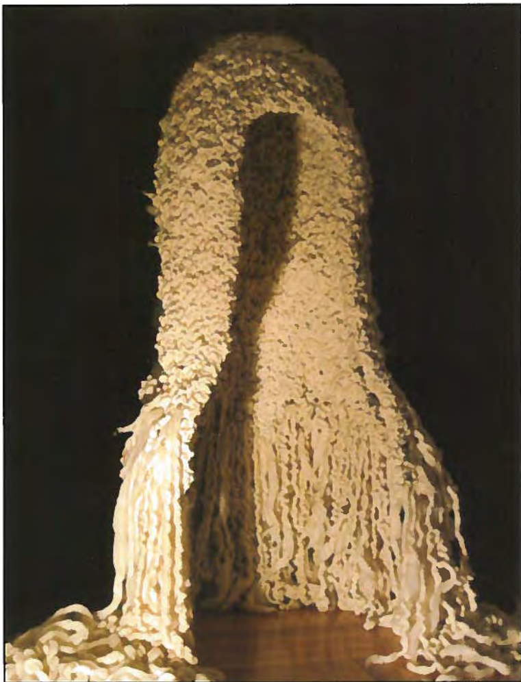
Karen Ciaramella Divine Goddess, 2007 Wool 72 x 72 x 60 in. Collection of the artist