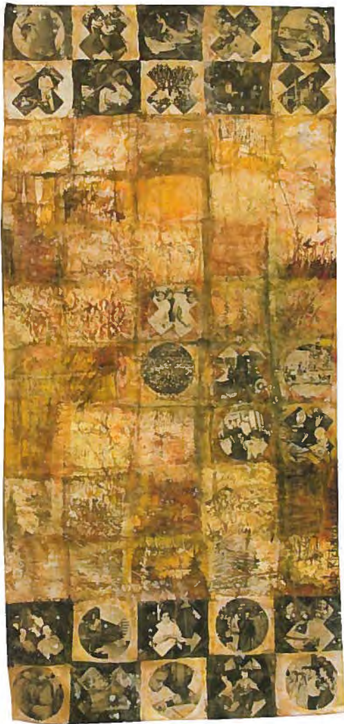
Robert Richardson Paper Blanket , 2007 Mixed media 36 x 72 in. Collection of the artist