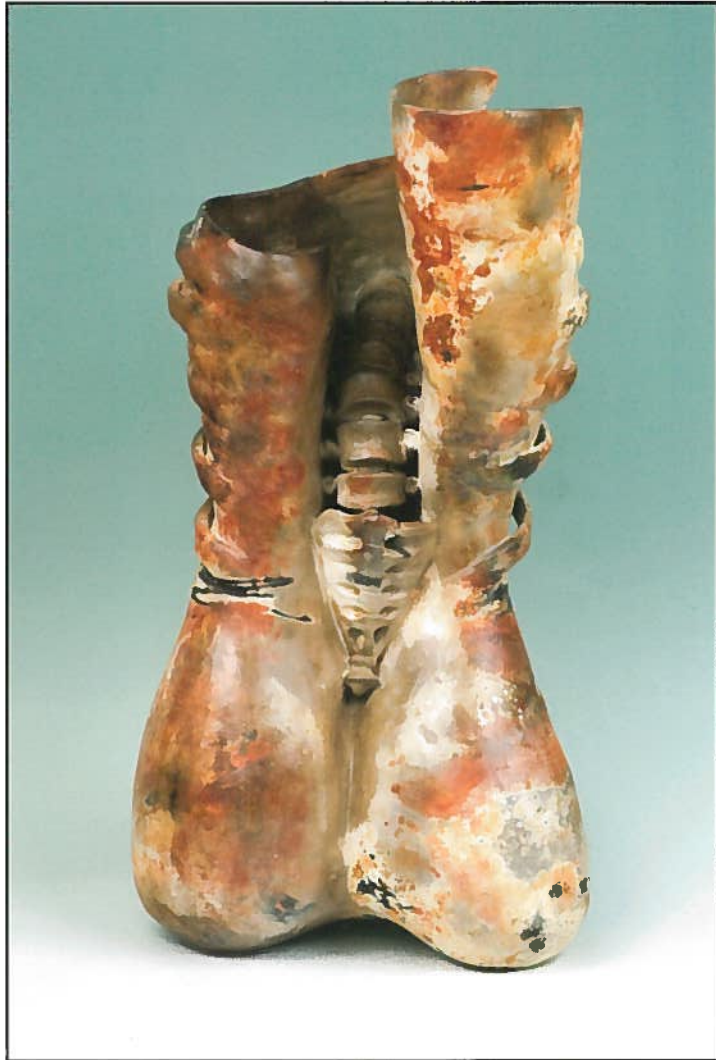
Monica Litvany The Operation, 2007 Clay 19 x 14 x 9 in. Collection of the artist