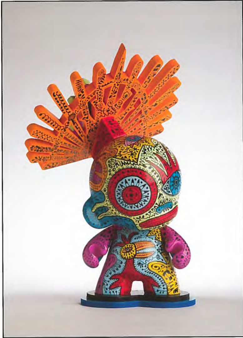
Daniel Fenelon Urban Kachina , 2007 Mixed media construction 12 x 5 x 5 in. Collection of the artist