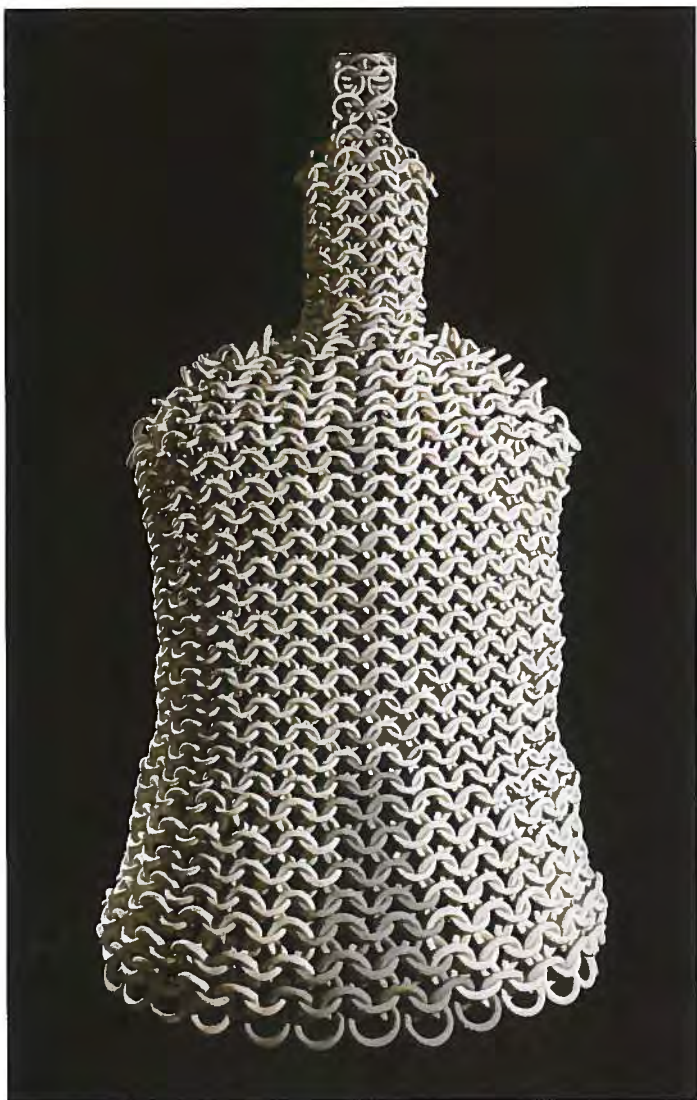
Ruth Borgenicht Anonymous Outfit I , 2002 Stoneware 45 x 26 x 22 in. Collection of the artist