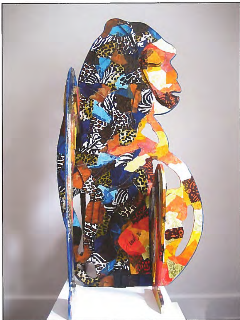
Terry Miller Brewin Godiva Gorilla , 2006 Mixed media 46 x 28 x 23 in. Collection of the artist