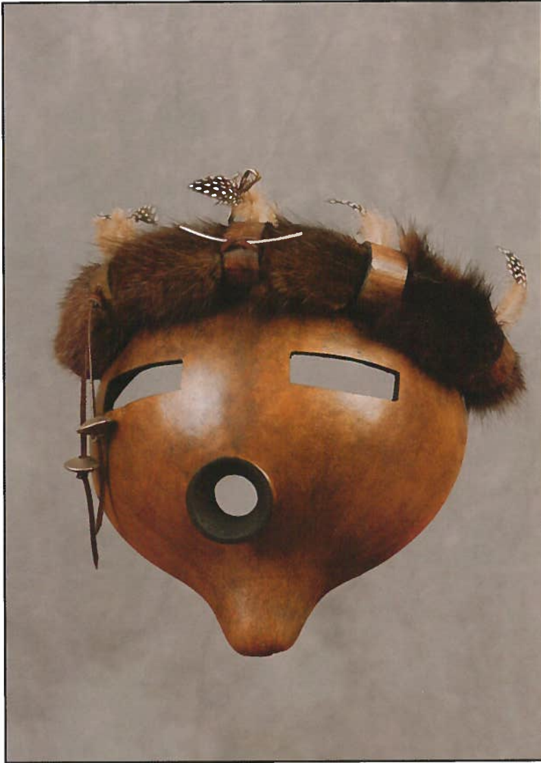
Vicki Diamond He Calls , 2006 Mixed media 12 x 10 in. Collection of the artist