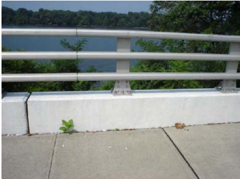
Figure 5. Close-up View of Coated Surface