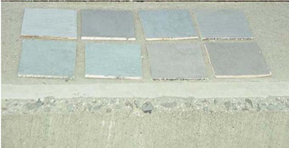
Figure 1. Various Color Schemes to Match the Color of Parent Concrete Surface

pigments to obtain a white concrete color. Small slabs coated with the modified matrix (Figure 1) and small patch applications at the back of the structure were used to obtain NJDOT approval. A typical trial patch is shown Figure 2. The approved color for the coated surface looks closer to a white concrete surface.