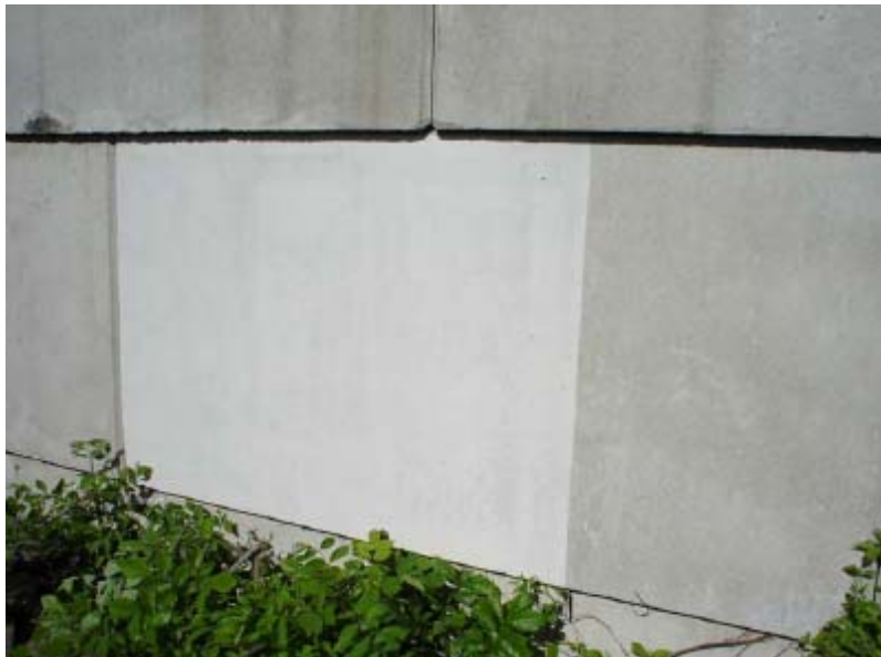
Figure 2. Test Patch (more than two years old)