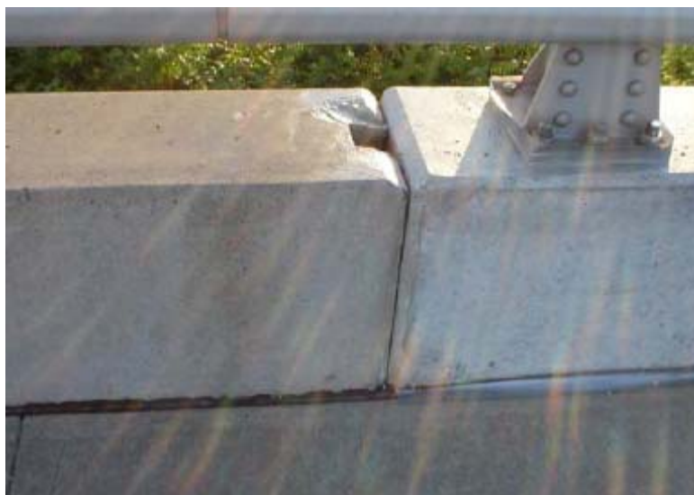
Figure 4. Uncoated Concrete Block Next to a Coated One