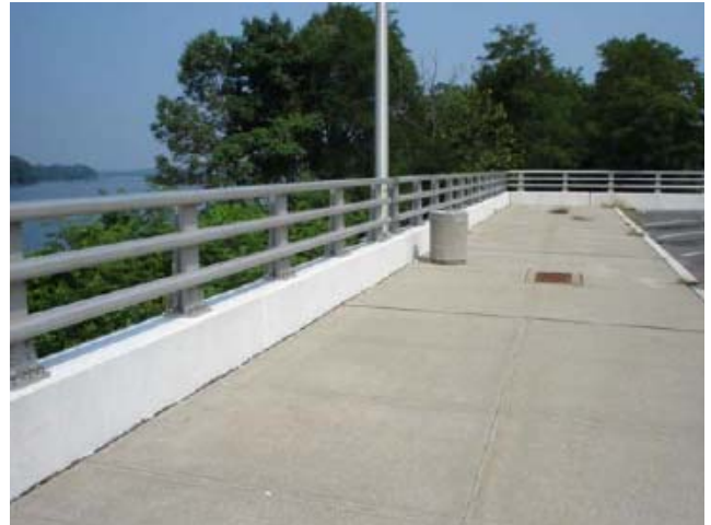
Figure 3. Uncoated Concrete Surface (on the left) and Coated Surface (on the right)