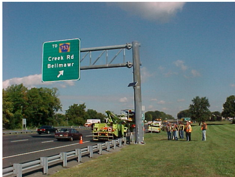
NJDOT maintenance crew deploying a traffic sensor in South Jersey