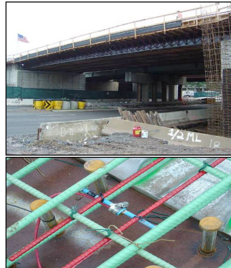
Figure 1 – Route 18 over Albany Street Bridge and VWSG installed in concrete deck

Many State Departments of Transportation (DOTs) expend significant effort and resources on the construction of durable concrete bridge decks. Existing data and current research indicate that specific modifications to construction procedures, materials, and design details can significantly reduce the degree of cracking in bridge decks, thus reducing the exposure of reinforcing steel to the corrosive effects of deicing chemicals and freeze-thaw damage. A great deal is known about the factors that affect cracking in bridge decks, however, there is a need to monitor deck performance and fully understand the effects of various design parameters on bridge cracking behavior. Figure 1 shows Route 18 over Albany Street Bridge that was instrumented and monitored for cracking using vibrating wire strain gages (VWSG).