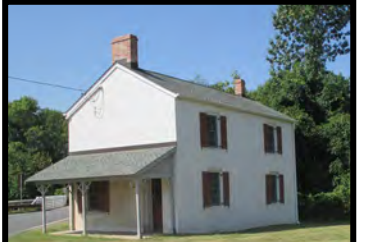
Bridge Tender's House

The canal and railroad turned the village of East Millstone into a thriving commercial and manufacturing town. The houses and the churches, in many architectural styles, retain the historic character of the village. The bridge tender's house and adjacent Franklin Inn are key landmarks of East Millstone. www.facebook.com/eastmillstone