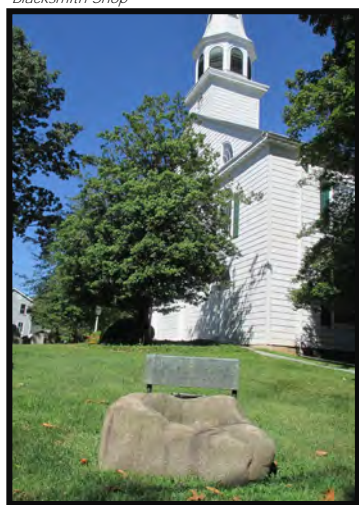
Hillsborough Reformed Church