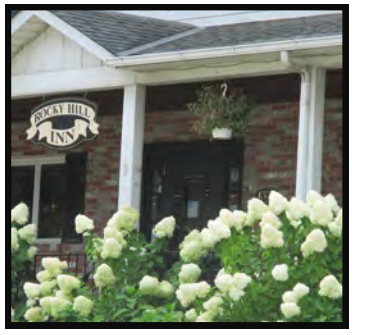
Rocky Hill Inn

Today Rocky Hill is a charming example of a 19th-century village, where visitors can see many architectural styles, including Federal, Greek Revival, Second Empire, Queen Anne, Carpenter Gothic, Italianate, and Bungalow. Travelers in 1748 called it Rockhill, because it was covered with rocks so big it took three men to roll them! www.Rockyhill-nj.gov