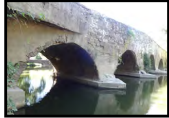
1798 four-arch stone bridge