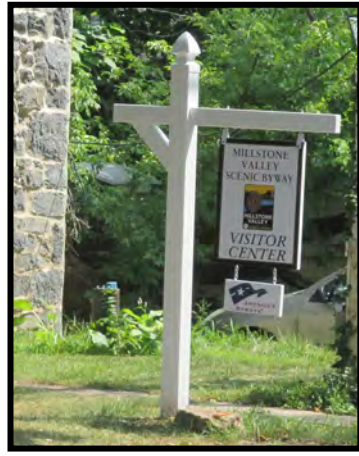
Bridge Tender's House

The Griggstown lock is located 0.7 of a mile south of the Griggstown Causeway on Canal Road.