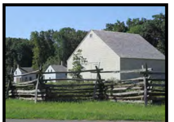
View of the barn from the road

Rockingham, now a state historic site, served as General Washington's final Revolutionary War headquarters in 1783, while the Continental Congress met in nearby Princeton. Here Washington awaited news that the Treaty of Paris had been signed, and the 13 colonies were independent of Great Britain. Check the website for times of opening. www.rockingham.net/ 609-683-7132