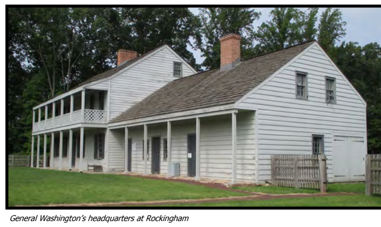
General Washington's headquarters at Rockingham