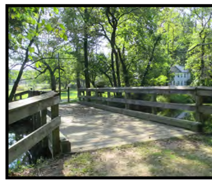
Little Valley towpath access

In 1973 the D&R Canal was placed on the National and State Registers of Historic Places, and the next year it became a state park. It is also designated as a National Recreation Trail and is part of the East Coast Greenway. As a state park, it is a premier recreational destination. Visitors can canoe, kayak, bike, jog, walk, snowshoe, cross-country ski, paint, photograph, ride horses, fish, and bird watch: over 160 bird species have been spotted within the byway corridor. Check the D&R Canal website for information and trail maps. www.dandrcanal.com/ 609-924-5705