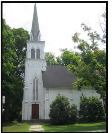
First Reformed Church