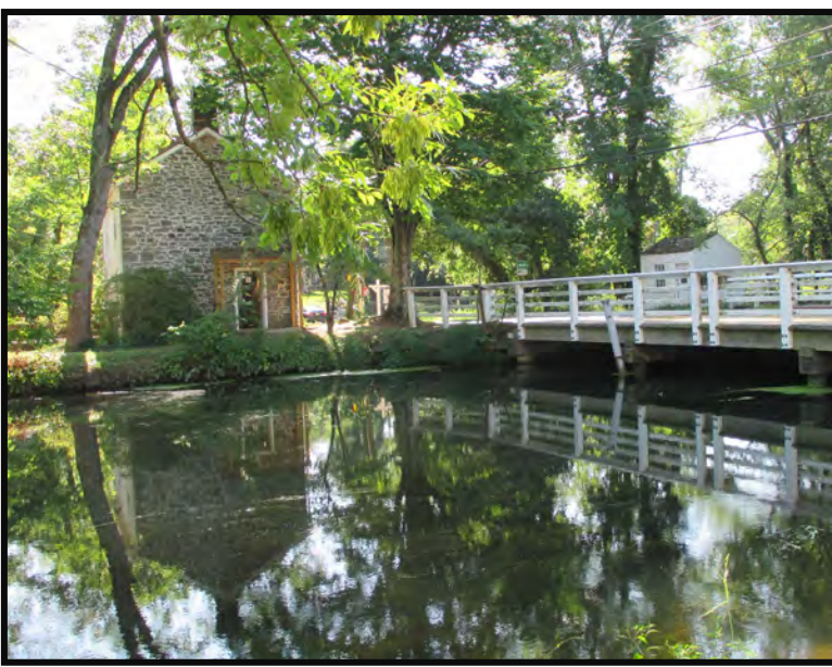
Griggstown Bridge Tender's House

Close your eyes; is that the wind or the soldiers' whispers as they trudge by? Major troop movements and military campaigns which greatly influenced the outcome of the American Revolution took place along the Millstone Valley Scenic Byway. The entire Byway Corridor is within the Crossroads of the American Revolution National Heritage Area and the Washington Rochambeau Revolutionary Route.