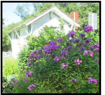
Garden at Blackwells Mills

It would be hard to find a 19th century vignette as nicely preserved as Blackwells Mills, with its picturesque bridge tender's house, garden and access to Six Mile Run. www.dandrcanal.com/friends_bwm.html