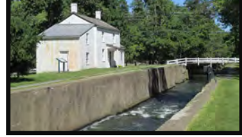
Lock Tender's House