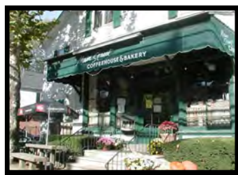
Main St Coffeehouse (Rt 27/Lincoln Highway)

Today Kingston retains its charming character and small-town appeal, with several shops and places to eat. A path leads to the canal area, which includes Lock #8, a lock tender's house, a toll house/telegraph office, and a turning basin. Nearby is the 1798 four-arch stone bridge over the Millstone River and the 1892 Kingston Mill. www.ksnj.org