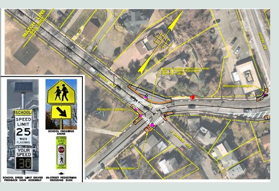
Highlands Borough - Highlands Safe Routes to School Phase 1 Pedestrian Safety Improvements