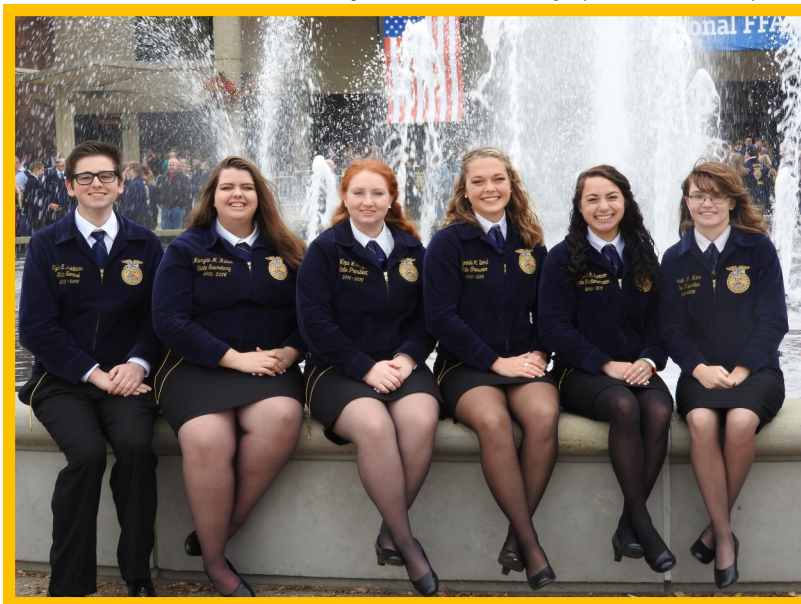
2015-2016 NEW JERSEY STATE FFA OFFICERS

Financially support FFA activities that prepare New Jersey FFA members for leadership and careers in the science, business and technology of agriculture.