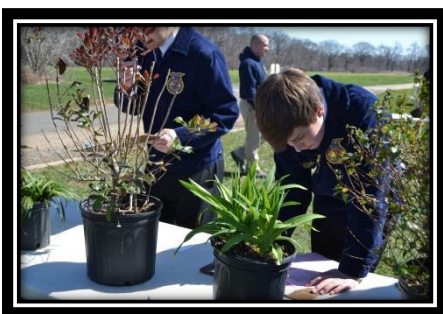
Students participate in Career Development events that test students' knowledge of an agriculture-related field and prepare them for future careers.

The New Jersey FFA Foundation, Inc. is a non-profit organization that provides financial support to agricultural education students through activities of the New Jersey FFA Association. Contributions to the New Jersey FFA Foundation, Inc. are 501(c)(3) tax deductible.