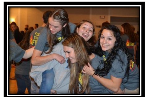
The Leadership Experience and Development Conference teaches students about teamwork and premier leadership.