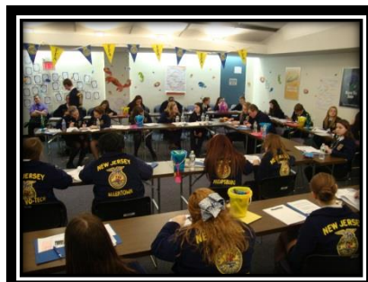
Students interested in learning more about state FFA office attend State Officer Candidate School in January.