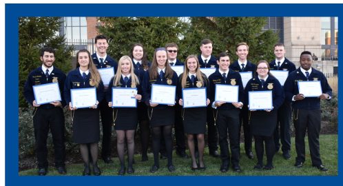
2019 American FFA Degree Recipients

YES, I WANT TO SUPPORT THE NEW JERSEY FFA FOUNDATION, INC.!