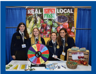
National FFA Convention & Expo Hall of States

Charitable donations to the New Jersey FFA Foundation, Inc. are tax deductible.