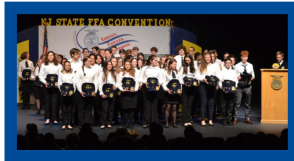
2019 Blue Jackets. Bright Futures. Recipients