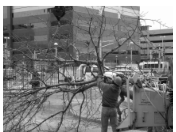
A tree removed as part of Asian longhorned beetle control efforts in Jersey City is fed into a chipper.

A total of 461 host trees were removed and more than 1,000 other trees safeguarded with imidacloprid treatments as part of state and federal efforts to eradicate the Asian longhorned beetle, detected in Jersey City in 2002. The Asian longhorned beetle is a foreign insect pest that attacks and kills