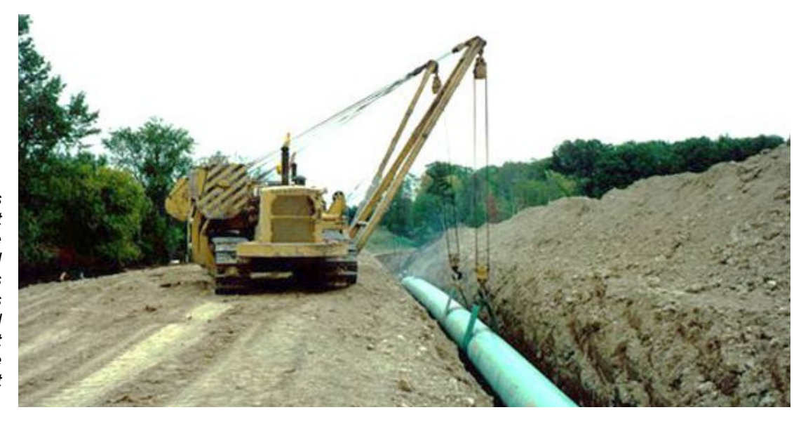
The SADC works to ensure that proposed pipeline projects avoid preserved farms and other lands in agricultural development areas to the maximum extent possible.

SADC staff continued to work to evaluate and minimize impacts of four interstate natural gas pipeline projects, two local natural gas pipeline projects and three electrical power line projects involving preserved farmland or other land in agricultural development areas.