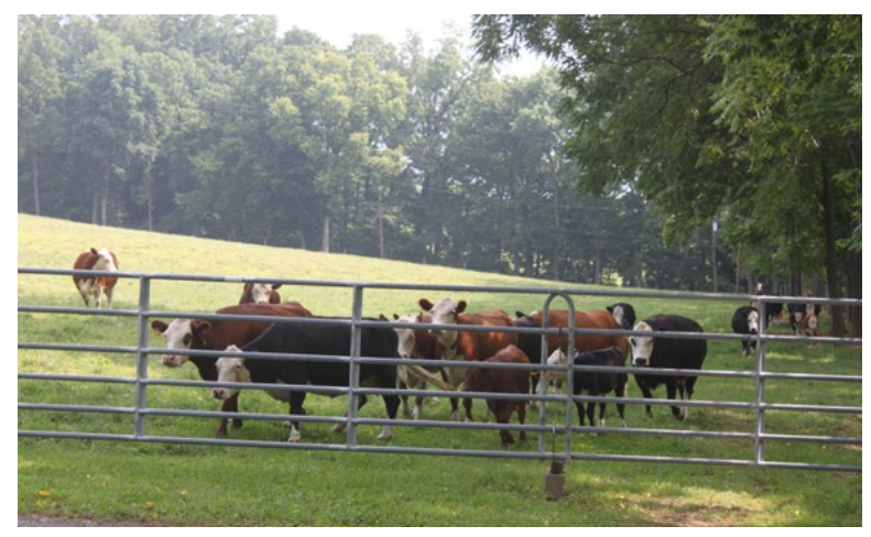
Sunny Hill farm in Harmony and Lopatcong Townships, Warren County, preserved by the Land Conservancy of New Jersey through the SADC's Nonprofit Program.

The SADC provides cost-sharing grants to nonprofits to assist them in purchasing development easements to preserve farmland. Seven farms totaling 293 acres were preserved under the Nonprofit Program in FY2015. See table on Page 13.